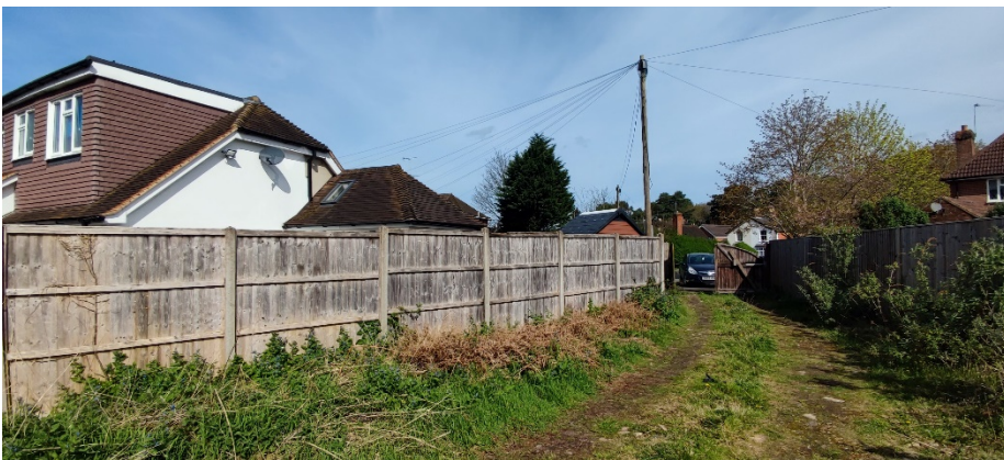
Rear of 1 Broadley Green