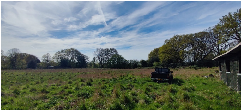
Rear of properties on Woodlands Lane whose gardens back onto the site