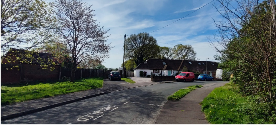
Entrance into the site